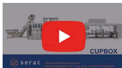
LINEA XS in CUPBOX version machine for non-stackable cups