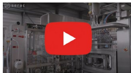
LINEA XS - Yogurt packaging machine, discover its many advantages

Discover the LINEA XS machine on video on our YouTube channel